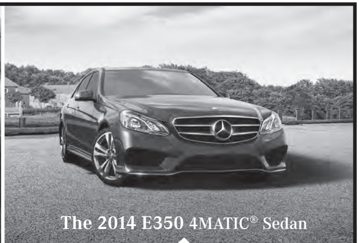
The 2014 E350 4MATIC® Sedan