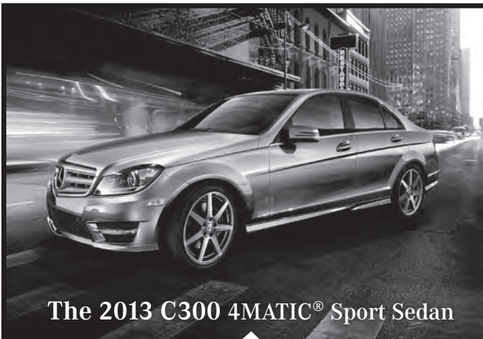
The 2013 C300 4MATIC® Sport Sedan